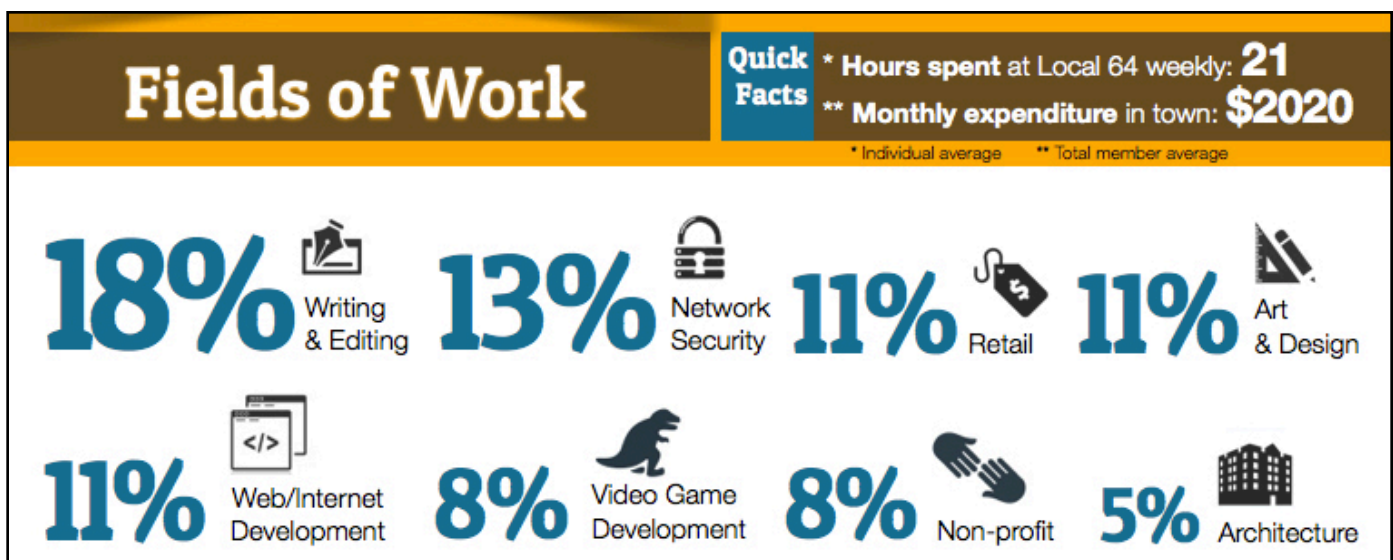
Illustration 2. Membership Fields of Work at Local 64

A final consideration are the goodies. One way we’ve been able to incentivize “leveling up” among memberships is adding a clear and entirely distinct value to members at the “Nomad” level and higher, which is a “Passport” relationship with Office Squared, a coworking space in Burlington. With the passport, which all members at the “Nomad” level and higher are entitled to after thirty days, any member can use Office Squared amenities at no cost. The same is true for Office Squared members: they can enjoy full, transferable membership to Local 64. While this opportunity has proven to be particularly valuable to a few members that have clients or parent offices in Burlington, it appears that mere awareness of this membership benefit is attractive.